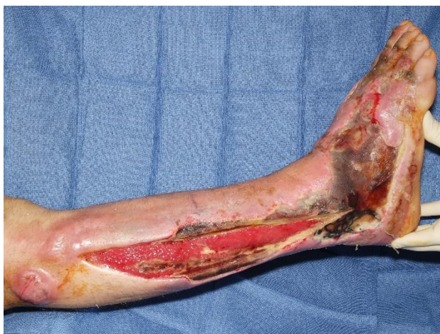
Figure 2. Epidermolysis of chronically fibrotic and inflamed skin after silicone injection.