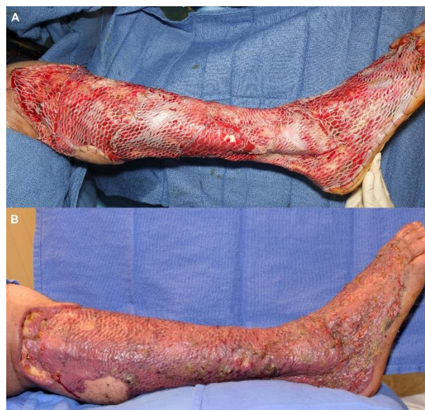
Figure 4. Split thickness skin grafting of right lower leg, (a) on-table result and (b) postoperative day 29.

The ensuing history of silicone injection has followed a cyclical course of legitimization through quality control of product and administration, disappointingly poor new outcomes, further restriction of indications, and qualified successes causing renewed expressions of concern in the