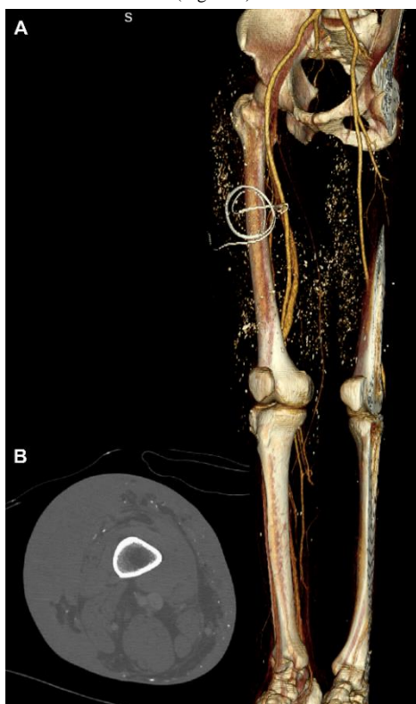
Figure 1. Computed tomography (a) three-dimensional reconstruction and (b) axial slice showing extensive lower extremity subcutaneous tissue infiltration with calcified granulomas and obliteration of fat, and sparing of muscular compartments.

subcutaneous tissue below the knee, sparing the plantar surface and toes, followed by negative pressure wound therapy. Pathology showed ulceration, extensive fibrosis, deep tissue necrosis, and numerous cystic spaces, some containing amorphous, refractile foreign material, compatible with silicone (Figure 3). No bacterial or fungal elements were identified within the tissues, and tissue cultures were negative. Five days after resection, the patient underwent meshed split thickness skin grafting of the affected area from donor sites on the back. The graft had nearly 100% take and, following a period of rehabilitation, the patient was able to ambulate (Figure 4).