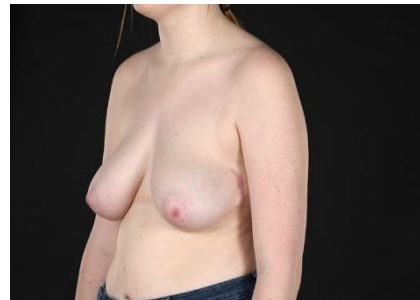
Figure 5: 3 months after lipomodelling to the left breast.