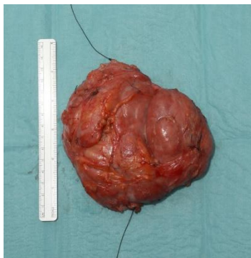
Figure 3: Excised left breast lump.