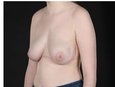
Figure 4: 3 months after excision of the left breast lump showing dimpling in the upper outer quadrant.

The patient tolerated the operation well with no significant complications. At 3 months, there was slight residual dimpling in the upper and outer quadrant of the left breast (Figure 4). Subsequently this dimpling was corrected by lipomodelling with 15mls of the autologous fat graft (Figure 5).