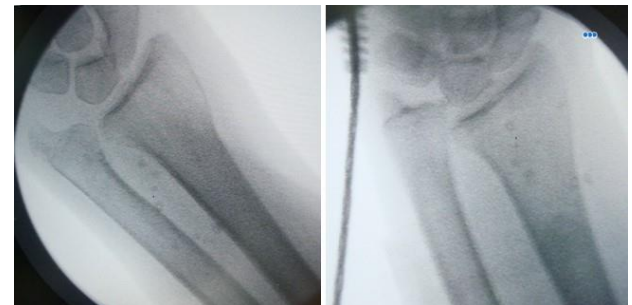
Figure 3: Intraoperative images showing a positive radius pull test. The DRUJ was stabilized with a reconstruction using an extensor hallucis longus autograft.

At three months postoperatively, the patient had persistent pain in the elbow and wrist, with mild ulnohumeral subluxation and early signs of loosening of the radial head arthroplasty on radiographs, suggesting a failure to stabilize the forearm. As the radial head loosened, the distal radius migrated proximally with progressive failure of the distal graft. A second operation was then performed resecting the shifted radial head arthroplasty, performing an ulnar shortening osteotomy with temporary pinning of the DRUJ, and a forearm reconstruction. The allograft was passed through the ulnar incision under the extensor muscles and fixed