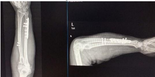
Figure 5: Final radiographic result of surgery after 8 years. During the initial stages there was a mild increase in ulnar variance that stabilized over time.

The patient improved dramatically after this operation, resolving any wrist and elbow pain. Over the years, the radius has shifted a few millimeters proximally without any clinical consequence. After eight years of follow-up, our patient continued to show good elbow, wrist, and forearm range of motion with no work limitations and considered his elbow to be almost normal (Figures 5 & 6).