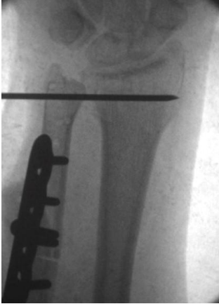
Figure 4: Ulnar shortening fixed with a dedicated ulnar plate and a K-wire for temporary fixation.

proximally with two small fragment screws through a separate dorsal incision on the proximal forearm (Figure 4).