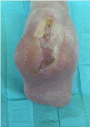
Figure 5: The wound healed 20 months since the first surgery.