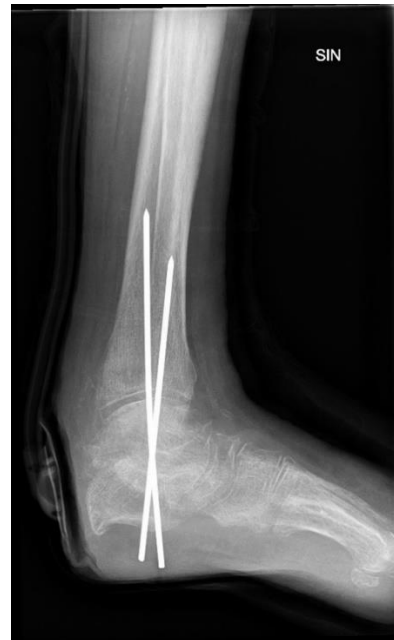
Figure 3: Temporary arthrodesis performed contextually with partial calcanectomy.

Five weeks later the first skin grafting was performed, leading to an attachment of about 50% of the engrafted area. In the following months the patient underwent a further debridement and skin graft, complemented with a perilesional injection of microfractured autologous adipose tissue (LIPOGEMS®), collected from the flanks and abdomen. The superficial residual dehiscence limited to the plantar region was subsequently treated with a small flap of local rotation, supplemented with daily local application of an ointment based on allantoin and polyethyleneglycol and furthermore the application of cold atmospheric plasma (CAP kINPen®MED) in a cycle of 2 weeks.