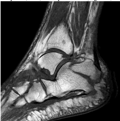
Figure 2: Calcaneal fracture following penetrating ulcer.

The radiologic assessment relying on RX and MRI, showed a calcaneal fracture classified as type 3 according to Hedlund and a type A meanwhile according to Essex-Lopresti (Figure 2). An antibiotic therapy consisting of Ceftriaxone iv. was administered because local biopsies showed the presence of osteomyelitis caused by E. coli . The blood tests indicated an inflammatory process with a CRP 203mg/L and WBC 15.8 \times 10^9/L . The patient underwent a conservative surgical therapy consisting of debridement of the necrotic tissue and pose of NPWT-d supplemented with Octénidine. Negative pressure instillation therapy was maintained for 5 days to be subsequently replaced with conventional NPWT. Two weeks later a further debridement was performed, including samples for bacteriological analysis. In consideration of the negative result of the bacteriological cultures, a partial calcanectomy, a temporary ankle arthrodesis and the placement of a skin regeneration template (DRT) were performed (Figure 3).