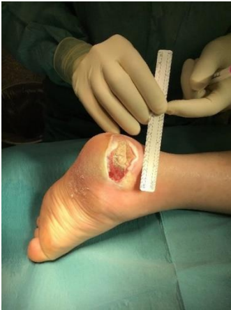
Figure 1: Penetrating calcaneal ulcers due to preexisting high pressure.

A treatment including dressings with iodopovidone and a study using a colour doppler ultrasonography of the inferior limbs were initially performed, detecting peripheral arterial disease affecting the left lower extremity with a >75% stenosis of the superficial femoral artery and suspect complete occlusion of the posterior tibial artery. After performing PTA of the lower left limb, Clopidogrel was introduced. In the following weeks, despite the angiographic success of PTA, there was a worsening of the clinical picture consisting of the appearance of a wet ulcer, with a diameter of 3 cm, extending deep to the calcaneum (Figure 1).