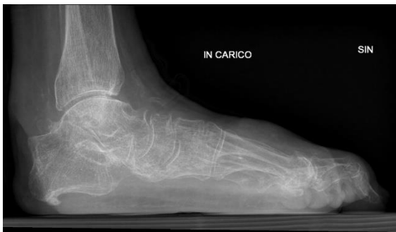
Figure 6: Radiological control at the end of the therapy.