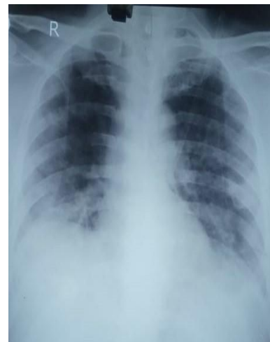
Figure 3: A-P view Chest X-ray (7th day post admission), an improvement in air entry bilaterally.

Breathing exercises involved diaphragmatic and segmental breathing along with thoracic expansion exercises. When patient started tolerating sitting position, progression was made to standing position. Initially the patient felt giddy which improved when patient spent more time sitting upright as advised. When the patient started tolerating standing position and maintaining normal vitals in standing, he was progressed with spot marching, rotation of head and trunk for balance training (5-10 repetitions) and walking sideways besides the bed (5 steps on each side). On subsequent days when the complaints of giddiness subsided, progression was made with patient made to walk around the bed (2 circles). As per the guidelines, drop of oxygen saturation of >3 percent and/or increase in the pulse rate above 120 beats per minute meant terminating the exercise and giving rest to the patient to restore the normal resting oxygen saturation and pulse rate and continuing thereafter if these vitals are stable [2, 6, 10]