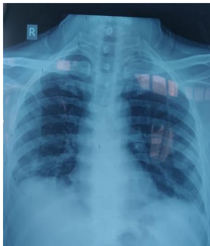
Figure 4: A-P view Chest X-ray (15th day post admission), bilateral fluffy shadows seen indicative of resolving ARDS.

Physiotherapy intervention along with medical management helped in improving ventilation perfusion mismatch, alveolar ventilation by optimizing oxygen transport and in maintaining normal fluid distribution in the body [12]. It also helped to prevent complications of bed rest, deconditioning and muscle weakness [13]. The physiotherapy management in parallel with medical management, nutritional care and counselling of the patient ensured excellent recovery, objectively demonstrated by improvement in the latter ABG reports and X-rays (Figures 3 & 4).