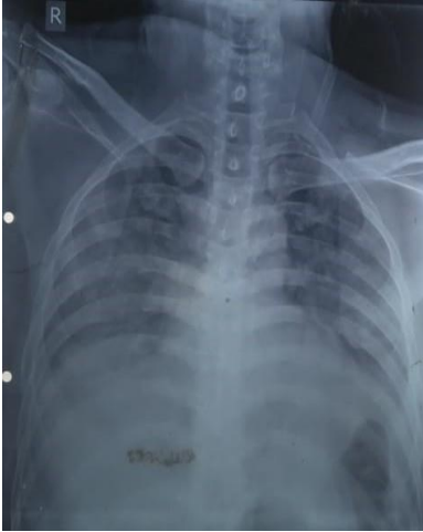
Figure 1: A-P view Chest X-ray (1st day of Admission), bilateral patchy ground glass opacities right more than left.

PaO 2 / FiO 2 ratio 45.85 indicating Type 1 respiratory failure and severe ARDS [8]. X-ray revealed ground glass opacities, reduction in the air entry, obliteration of cardiophrenic and costophrenic angles and some fibrotic changes bilaterally seen in (Figure 1 & 2).