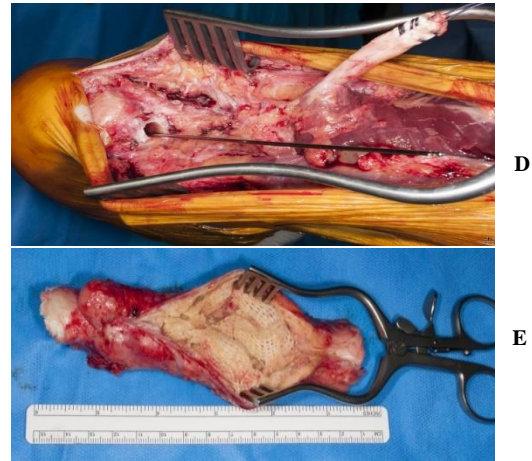
Figure 3: Demonstration of steps involved in surgical procedure. A) Intraoperative image of large cystic swelling over Achilles tendon. B) Synthetic LARS ligament found in the swelling on incising. C) Whole swelling was lifted off and excised. D) Intraoperative image showing FHL tendon lifted. E) Specimen of mass after excision.