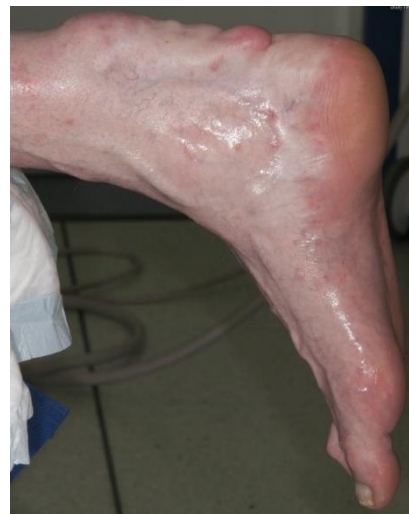
Figure 1: Picture of foot showing lobulated swelling over right Achilles tendon.

lobulated swelling in distal calf and posterior to ankle with no inflammatory skin changes or discharge to suggest an infection (Figure 1). MRI scan showed heterogeneous 16 × 6 cm collection within the Achilles tendon (Figure 2).