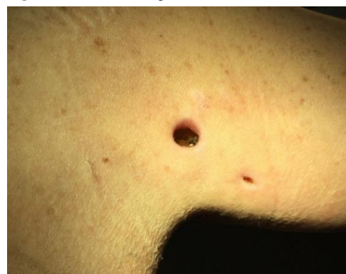
Figure 7: Case no. 3: Axillary fistula following a dog bite in patient previously subjected to lymphadenectomy (150 days).