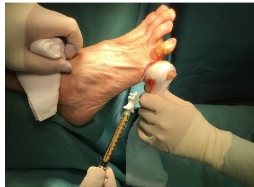
Figure 13: Case no. 4: Interdigital fistula, MFAT infiltration.