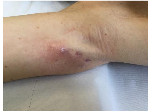
Figure 11: Case no. 3: Healed axillary fistula.