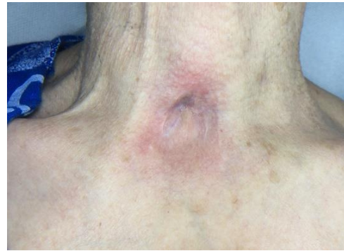
Figure 4: Case no. 1: Repaired fistula.