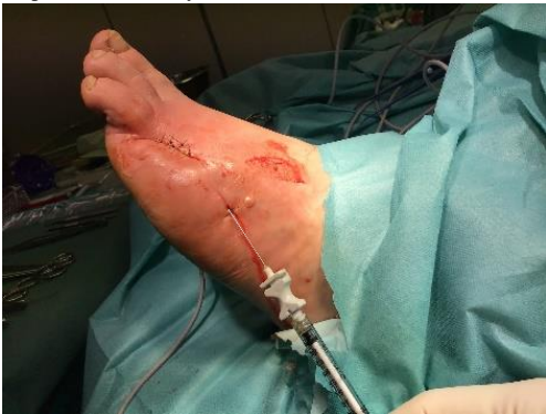
Figure 16: Case no. 6: Dorsal foot fistula in DFU, intra and peri lesional infiltration of MFAT after debridement and suturing of the fistula orifices.