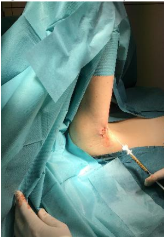
Figure 10: Case no. 3: Axillary fistula, infiltration of intra and peri fistular MFAT.