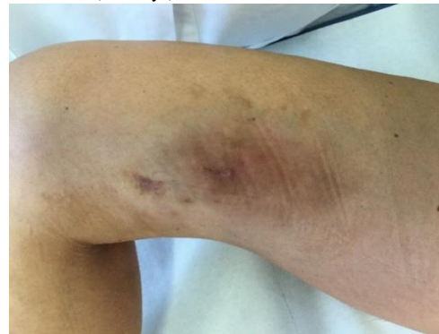
Figure 6: Case no. 2: Repaired fistula.