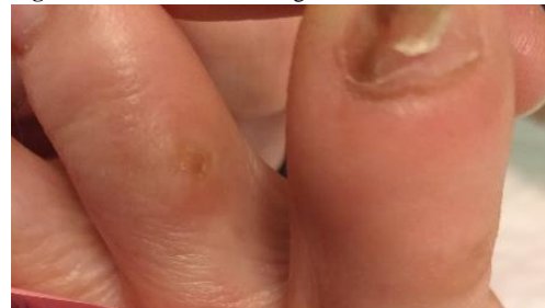
Figure 14: Case no. 4: Interdigital fistula healed.