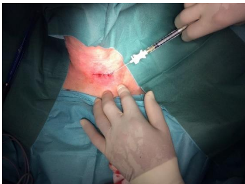
Figure 3: Case no. 1: Intraoperative image, intra and peri fistular infiltration of MFAT after debridement and suturing of the orifices.