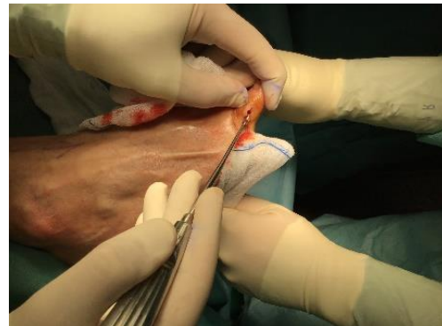
Figure 12: Case no. 4: Interdigital fistula, intraoperative debridement.