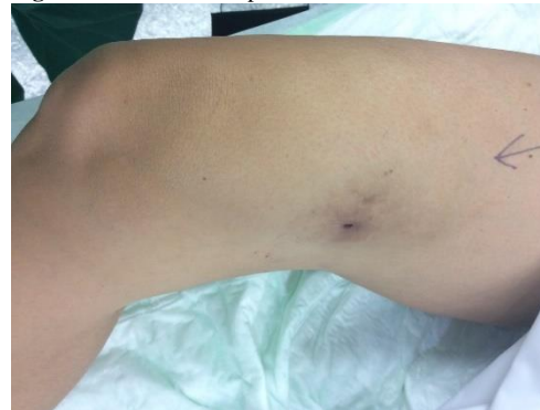
Figure 5: Case no. 2: Fistula in the right thigh following an infected hematoma (133 days).