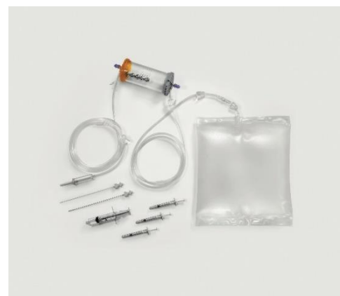
Figure 1: Complete kit for MFAT processing.

In the second phase of the procedure, the lipoaspirate is inserted into a completely closed device (Figure 1) that allows to wash the adipose tissue eliminating blood and inflammatory residues. The passage through two sharp progressive filters allows with only hydraulic action to gradually fragment the tissue until obtaining clusters of 0.3 mm in diameter. The possibility to carry out the fragmentation in a closed system and in the absence of air allows to avoid oxidative processes and to avoid the destruction of adipocytes by bursting as they are constantly kept immersed in saline solution even when subjected to pressure and hydraulic thrust aimed at the transit through the two progressive filters.