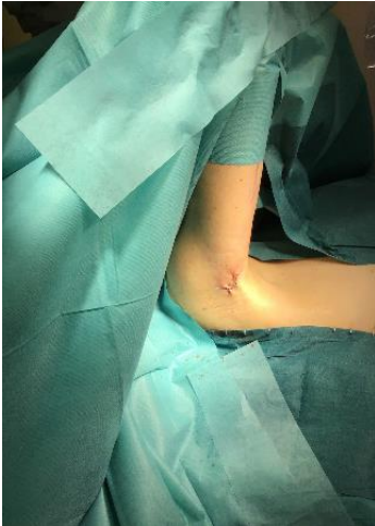
Figure 9: Case no. 3: Axillary fistula: suture.