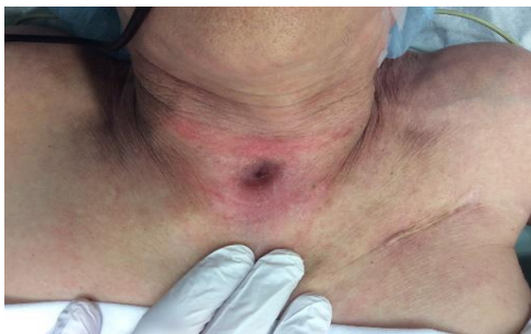
Figure 2: Case no. 1: Neck fistula in previous tracheotomy (181 days).

In 7 cases, treatment was given for non-healing skin fistulas. Five cases were female patients and 2 cases were male. The mean age was 57.2 years (32-82). The anatomic site was in one case at the neck (Figures 2-4), in one case at the level of the thigh (Figures 5 & 6), in one case at the arm (Figures 7-11), in two cases in the interdigital spaces of the foot (Figures 12-14), and in two cases at the level of the foot (dorsum of the foot and forefoot) (Figures 15-17).