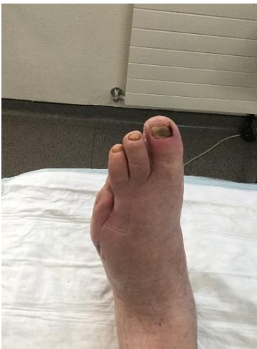
Figure 17: Case no. 6: DFU dorsal foot fistula healed.

Fistulas persisted for between 128 and 243 days with a mean of 165 days. Comorbidities included diabetes, hypertension, arteriopathy, COPD, AF, conditions with steroid treatment, and sleep apnea syndromes,