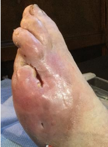
Figure 15: Case no. 6: Dorsal foot fistula in DFU after 4th and 5th finger amputation (128 days).