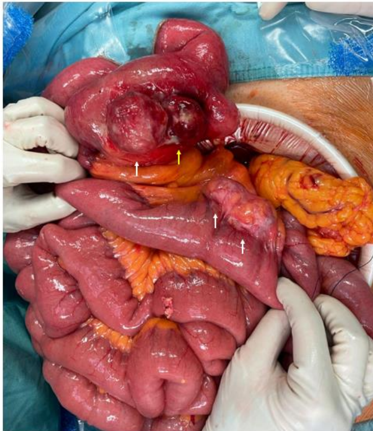
Figure 2: Intra-operative findings showing all four jejunal diverticula, indicated by arrows (the yellow one indicates the perforated diverticula).